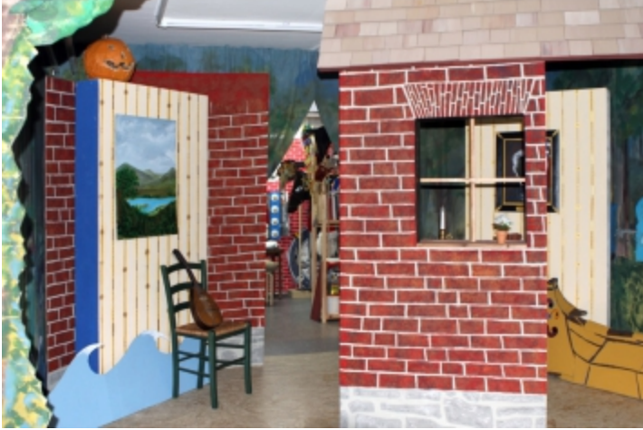
Above: Jurgen Ostarhild, #C42930, Screenshot from "Seconds machine", © Jurgen Ostarhild. Below: Christopher Kline, Exhibition view of "Framework 5: O.K. – The Musical (Pre-Production)", insitu, Berlin, 2015, © Christopher Kline.